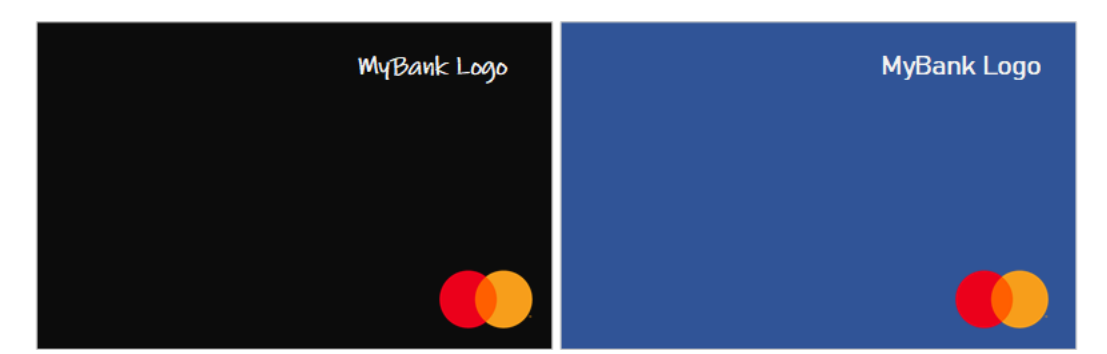
Figure 5: Background Image

See examples of background images below.