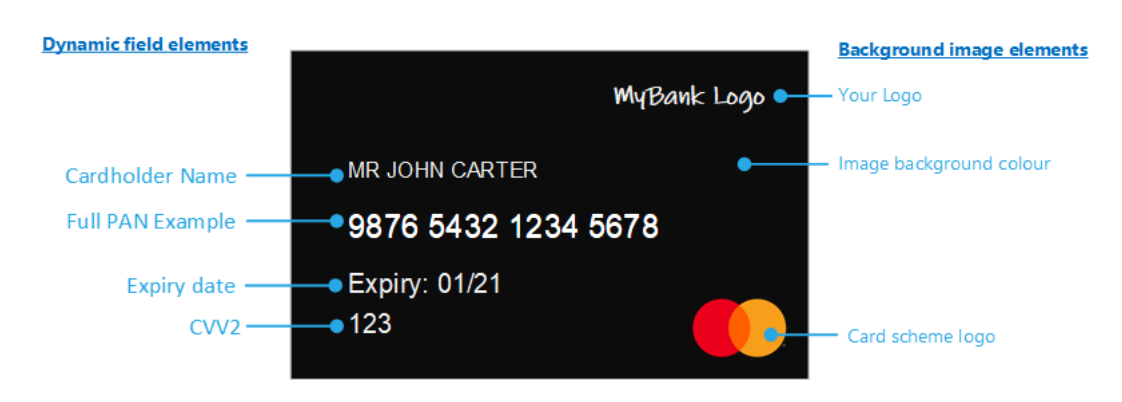
Figure 6: Example of a Virtual Card Image

If you are not PCI compliant, the image can display your customer account number or the GPS token.